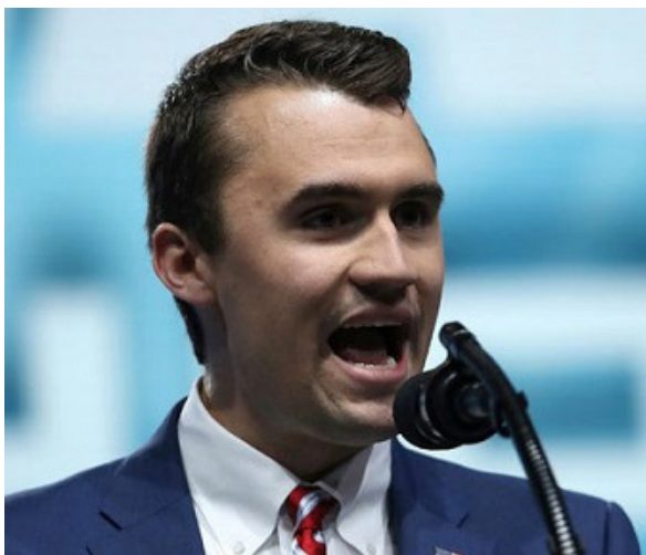
Charlie Kirk Founder of TPUSA

Kirk grew up outside of Chicago and says he dreamed of attending West Point, but he claims he lost his slot because of affirmative action. 7 This feeds into an idea he and TPUSA repeat constantly – that white