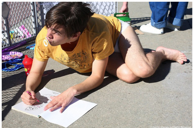
Chapter leadership at Kent State University complained that national TPUSA staff were nowhere to be found after the chapter held its widely mocked event where students dressed up in diapers and pretended to be babies.

In 2018, TPUSA's chapter at the University of Iowa disavowed Candace Owens in the wake of their fellow student, Mollie Tibbetts, being murdered. Right-wing media and political activists seized on and politicized