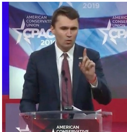
Charlie Kirk is a frequent speaker at the annual Conservative Political Action Conference.

During a presentation at Colorado State, Kirk called the concept of white privilege inherently racist. White